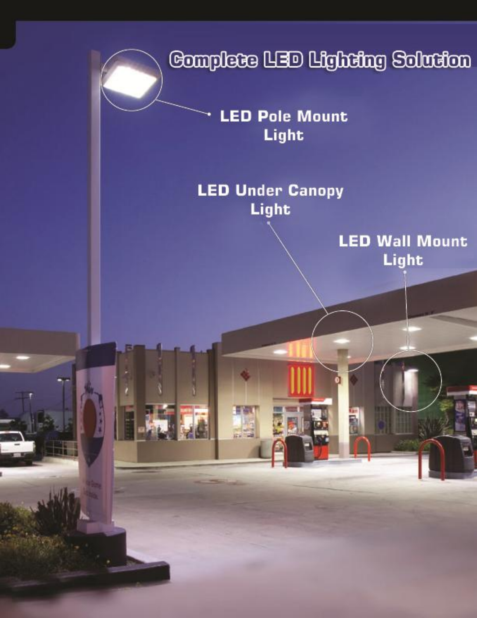
LED Wall Mount Light