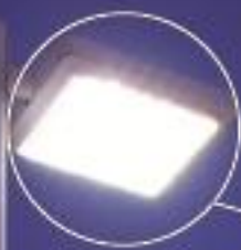
LED Pole Mount Light