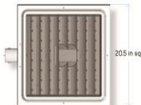
Pole Mount Light